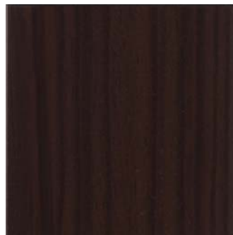
Finish Name: Wenge Descr: Simulated Wood Pattern - Dark brown/ cappuccino (almost black) Texture: Smooth Sheen: Semi-Gloss