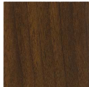
Finish Name: Walnut Descr: Simulated Wood Pattern - A traditional wood finish Texture: Grained Sheen: Semi-Gloss